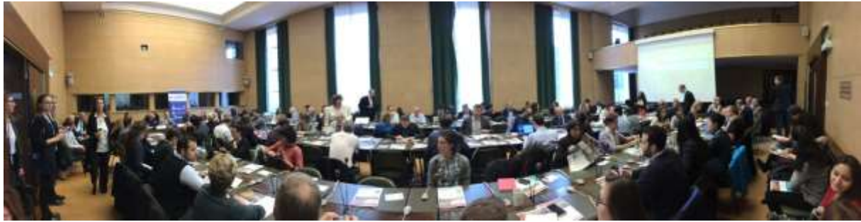
Launch of UNRISD's 2016 Flagship Report. Geneva, October 2016.